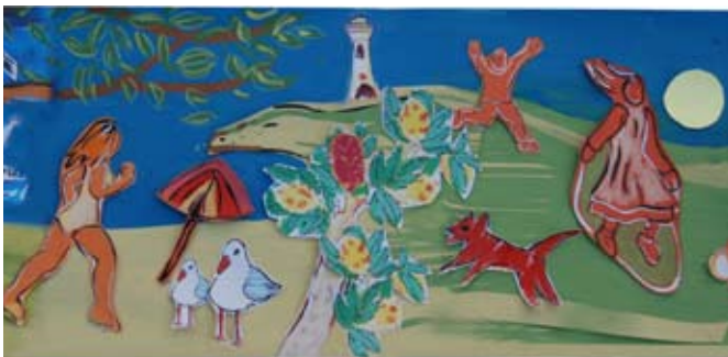
Detail from the design drafts for the new mural

Thanks to Westfield management and staff and to all the many individual shopkeepers at both centres who created such a special day for our children.