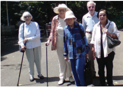
Left: Tuesday Bus Group visiting the Botanical Gardens; Right: Wednesday Bus Group enjoy a fun day in the famous Ettamogah Pub.

Our Weekly Bus Outing program for Tuesdays and Wednesdays has been running for many years and is still a popular day for all our clients. We provide a door to door service on these days and as such, these outings are invaluable to our frail clients who would otherwise be unable to get out and about. These trips have less walking and are designed for clients who no longer drive and may need a mobility aid such as a walking frame. Some sights visited this year have included Narrabeen Lakes and Homebush Bicentennial Park. Sydney's famous Chinatown hosted our Chinese New Year celebrations. Clients saw the vibrant colours of red and gold that are synonymous with the Chinese tradition of New Year. Many fabulous outings await with tours of Palm Beach, Leichhardt, Botany Bay and whale watching. We look forward to welcoming you on a day out with our caring staff!