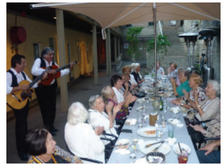
Top : Our night owls enjoying an Italian serenade at the Rocks.

A great night was had by all at the famous Caminetto's at the Rocks. This unique courtyard restaurant played host to our night owls who dined on classic Italian cuisine and traditional pastas, complete with a courtyard display of roving minstrels. We had a wander through the moonlit markets and saw some beautiful crafts and jewellery. Join us for our exciting program next quarter which will include a private and exclusive dinner at one of Australia's premier Golf Clubs.