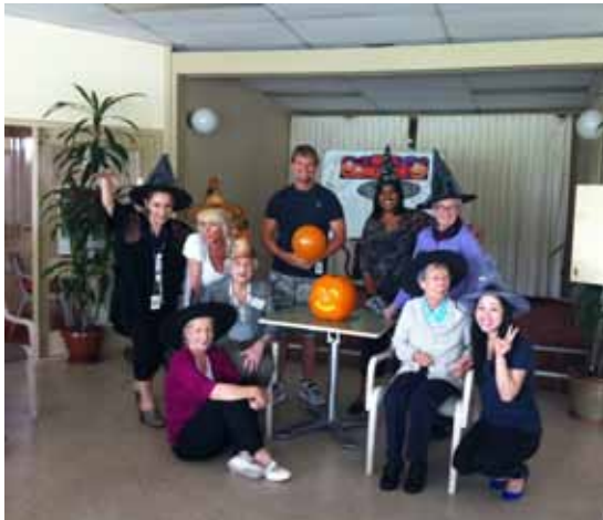
Above Left : The Holdsworth Club Witches

At our Club program the ghosts and ghouls were out in force for Halloween this year. Saturday, the 29th October marked our group Halloween Celebration with activities themed for the staunch of heart! There were ghost stories, pumpkin carving, a coven of witches to entertain our gang and our Club artists tested their skills in a special Halloween contest!