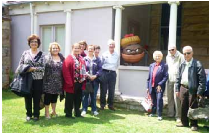
Left: Our Discovery group enjoying lunch at Eling Winery; Right: Magic Puddings at the Norman Lindsay Gallery.