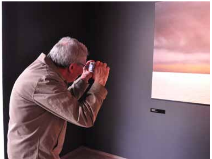
Above : Morris photographing landscapes; Below: Sofia using multiple images for varying effects.

Traditionally, art has been seen as a useful vehicle for people to express themselves whilst enjoying themselves. However, in practice, many people do not like painting or drawing or are too reserved to take part. Also, the Holdsworth vision of people being out and about in community settings does not sit easily with staying in and painting.