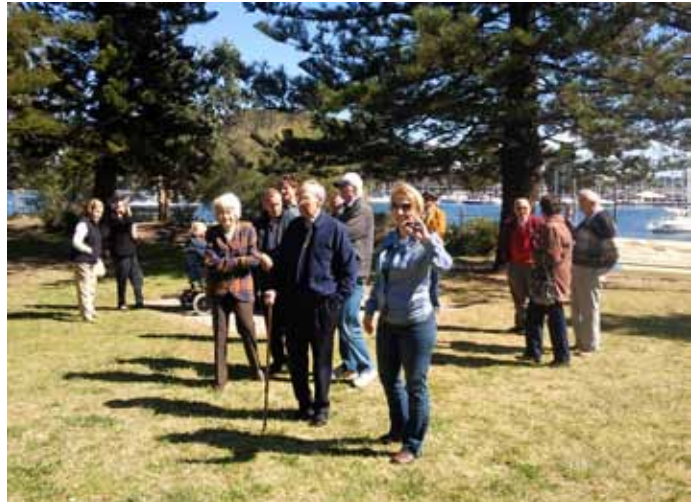
Above : Wednesday Bus Outing and Wednesday Club meet up at Clontarf Reserve for a mix and mingle.